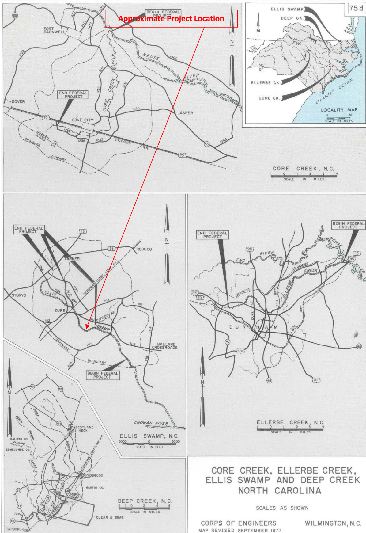
Figure 2: Federal Project Map